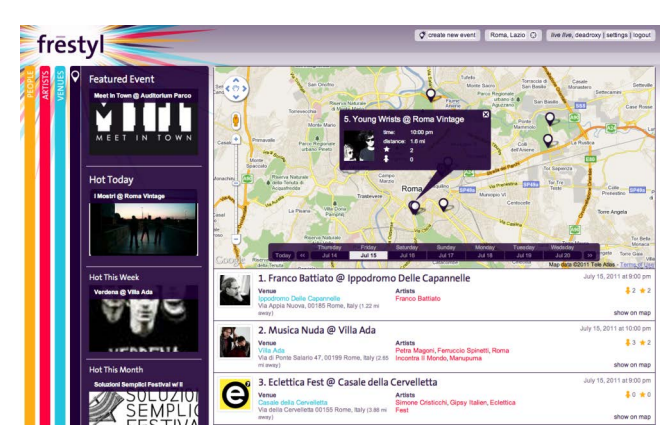
Figure 2. frestyl's homepage with all events happening today around the user.

In order to further simplify the process of promoting and discovering live music frēstyl has adopted an approach of local engagement and global accessibility. We will discuss this approach in the next section.